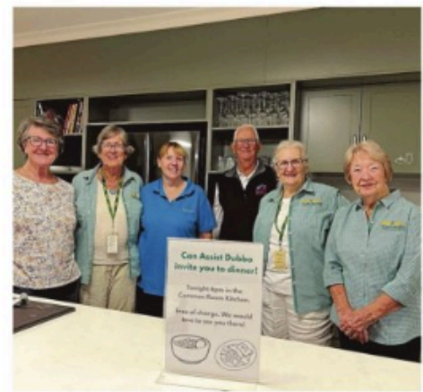
The Can Assist Dubbo members provide monthly dinners for MHS guests.

WHEN it comes to volunteering, the Dubbo community certainly knows how to put their hand up to help. The Macquarie Home Stay (MHS) dinner program has become an institution where volunteers provide an evening home-cooked meal free of charge for the guests. The dinners create an opportunity for not only a nourishing meal but a chance to catch up with other guests outside the hospital system. If you're stuck at the hospital all day, or not feeling well, cooking a meal can be the last thing on your mind. Guests going through similar medical journeys, whether they're having a baby, have a family member in hospital, are undergoing cancer treatment, or are staying by themselves, often appreciate the banter and conversations that arise through the dinner program. This is particularly the case if they're away from home for many weeks. The guests' dinners can have 30 or more attendees and all report how delicious the meals are, but more so the camaraderie and friend-