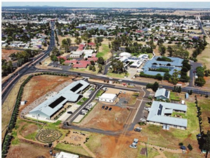
Macquarie Home Stay, just 800 metres from Dubbo Hospital, now operates 51 units of patient and family accommodation. The first guests occupied the new CWA of NSW Guesthouse in February 2025.

And so, the journey of Macquarie Home Stay continues. As Dubbo increasingly becomes the drawcard for medical care for the far-reaching communities of NSW, MHS will continue to meet patient accommodation needs. Call it magic or plain and simple help, where help is needed the most. That's MHS - supporting, caring and helping people so they can soon return to their regional communities and be with family and friends once more.